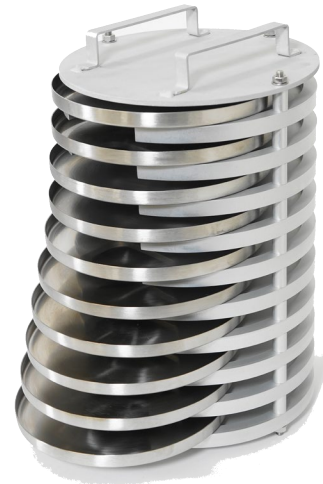
Precision assembled supporting rack with ten TFOT pans (included with the instrument)