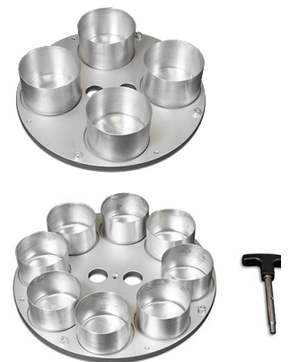
Double face sample holder for eight 55x35 mm or four 70 x 45 mm sample containers