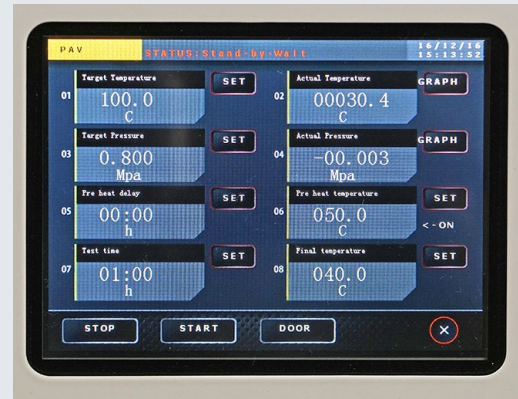
Temperature and pressure target values vs actual values.