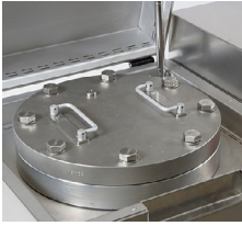
Detail of certified pressure vessel and cover locking switch