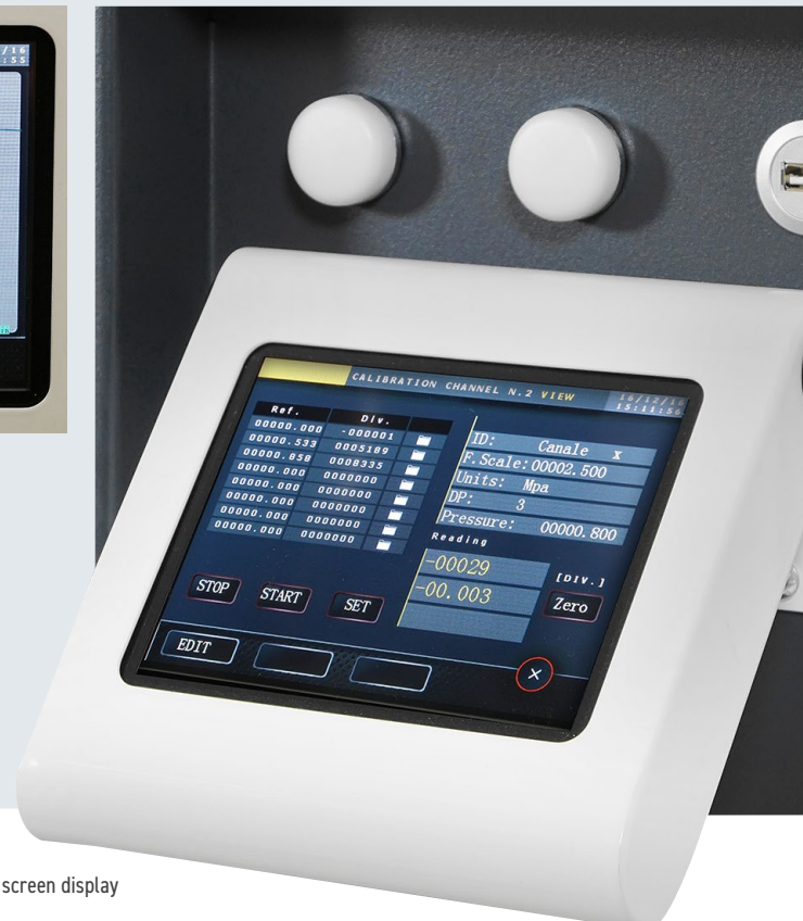
Detail of inclinable touch screen display