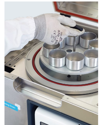
Double face sample rack positioning

Set of four 70x45 mm sample containers for VDO