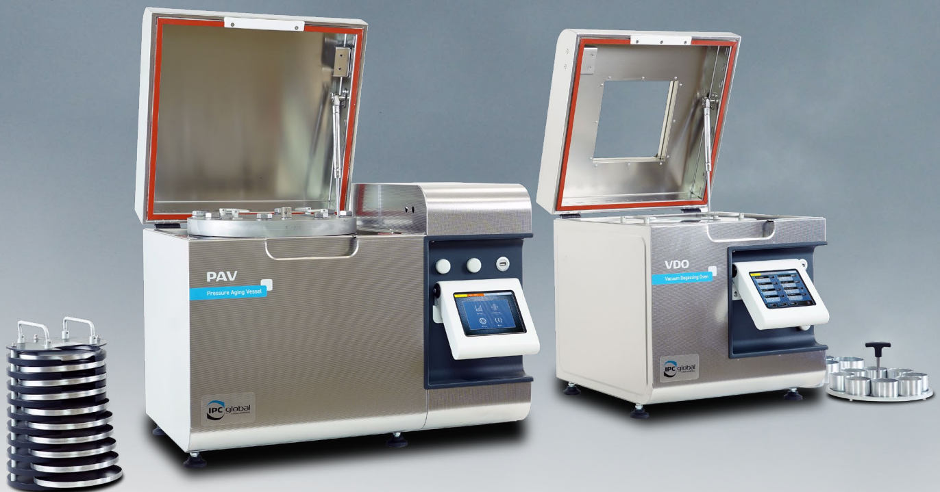
Pressure Aging Vessel (PAV) & Vacuum Degassing Oven (VDO) and related accessories